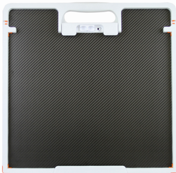
Rear Side with Twin-Lock™