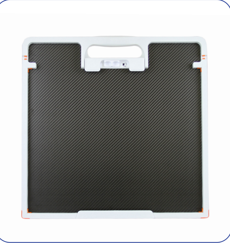
Rear Side with Twin-Lock™