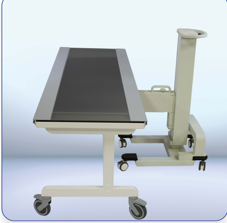
*Positioning Partner/Imaging receptor not included